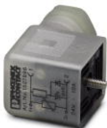
Valve connector, 3-pos., type BI, 1 LED, protective circuit, screw connection, cable screw connection Pg9

Please be informed that the data shown in this PDF Document is generated from our Online Catalog. Please find the complete data in the user's documentation. Our General Terms of Use for Downloads are valid ( http://phoenixcontact.com/download )