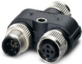
Y distributor, 5-position, Socket straight M12, A-coded, on Socket straight M12, A-coded and Plug straight M12, A-coded, Parallel distributor

Please be informed that the data shown in this PDF Document is generated from our Online Catalog. Please find the complete data in the user's documentation. Our General Terms of Use for Downloads are valid ( http://download.phoenixcontact.com )